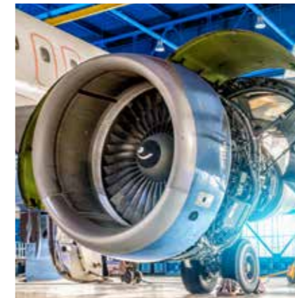
AEROSPACE & DEFENCE