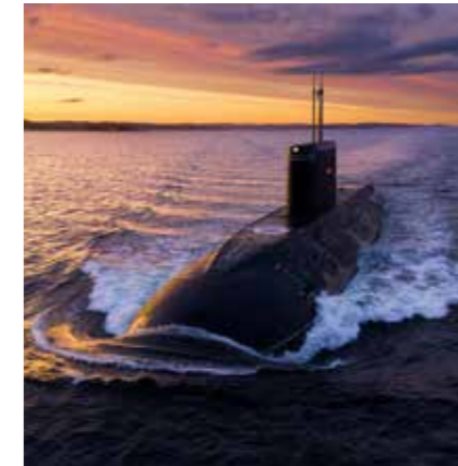
MARINE & SHIPBUILDING