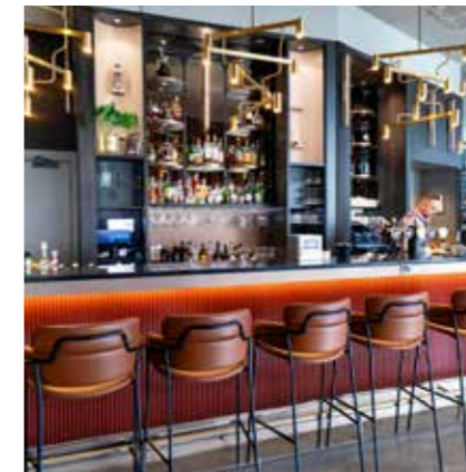
BARS & RESTAURANTS